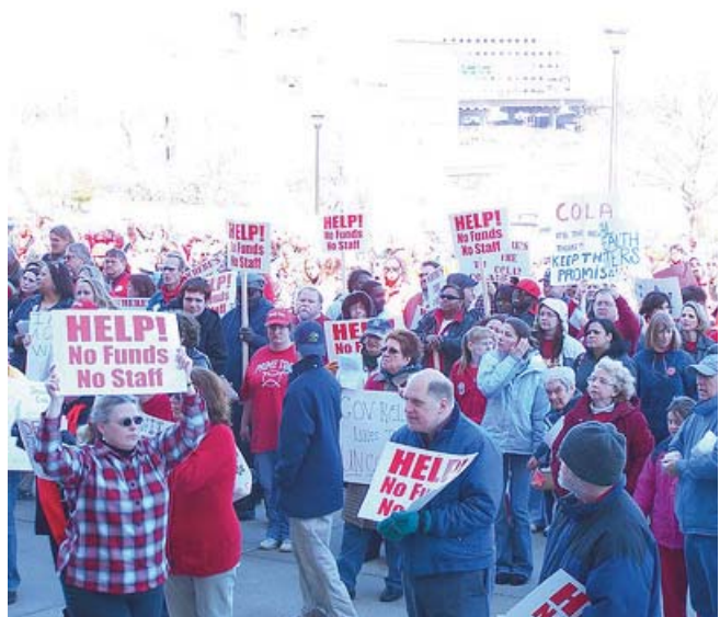
The Nonprofit sector came out in force during a rally at the Capitol, March 29, 2007, to urge state lawmakers to adequately fund nonprofit providers in the state.