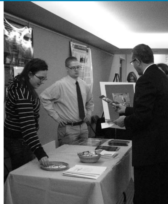
CT Nonprofits Week at the Capitol provides 100 members with a chance to showcase their missions and inform legislators and staff about their work.